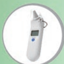
Infrared Ear Thermometer