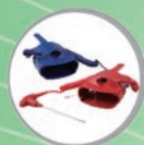
Covidien Quick Temp