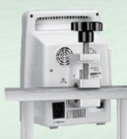
Bed Rail Clamp