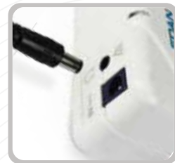
Compact Battery Charger