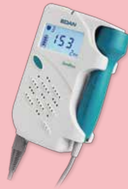
SonoTrax Ultrasonic Pocket Doppler