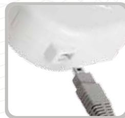
Interchangeable Waterproof Probe