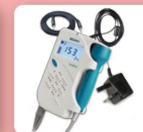
SonoTrax II Pro