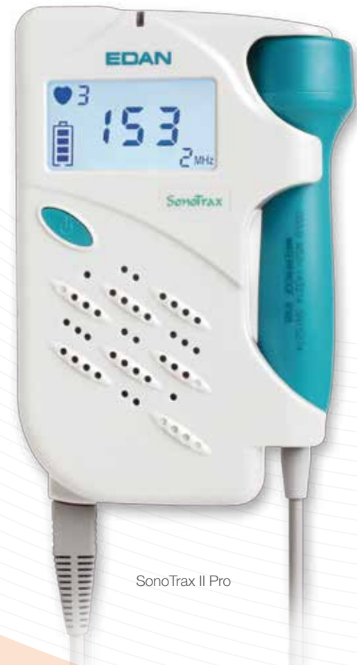
SonoTrax II Pro