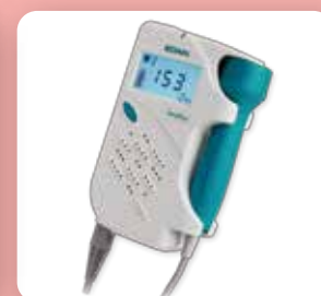
SonoTrax Basic A