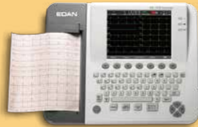
SE-1200 Express Electrocardiograph