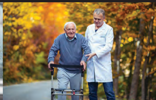
Long-term care facilities