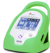
Tree Frog Green