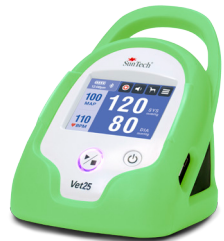
Tree Frog Green